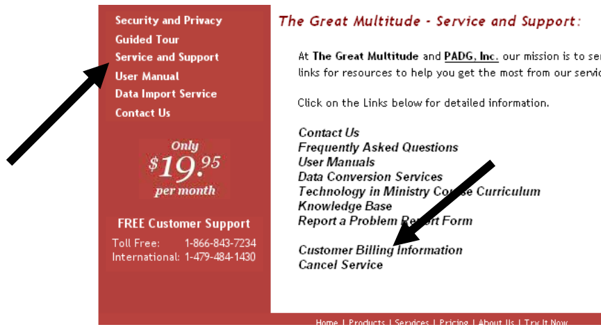
Figure 1-4 Enter Billing Information

After logging in, you will see the billing information service window. At the present time, the only payment options are VISA or MasterCard. Complete all of the required information and click on the Continue button . Your credit card information will then be verified and you will then have unlimited use of TheGreatMultitude.