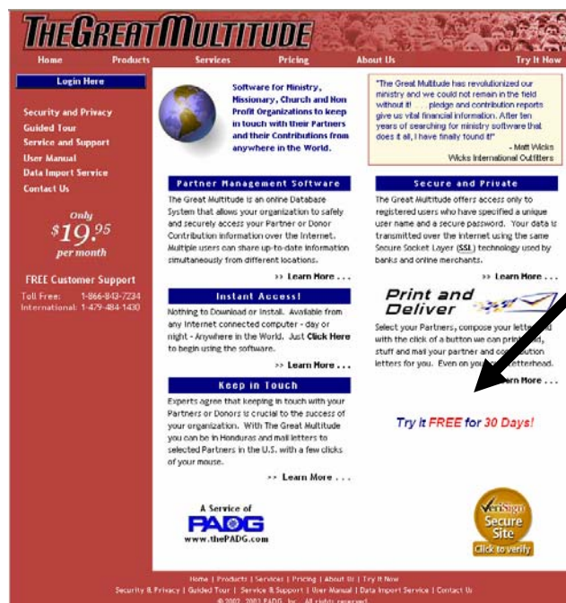
Figure 1-2 TheGreatMultitude

Click on either “Try it FREE for 30 Days?”.